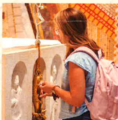
Venerate a first-class relic of Saint John Paul II's blood