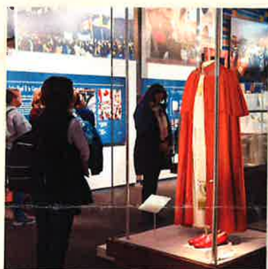
Explore our exhibit on the life of Saint John Paul II