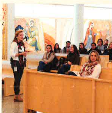
Tour the Sacred Art of the Shrine

Call 202.635.5400 or email visitorservices@jp2shrine.org today for more details!