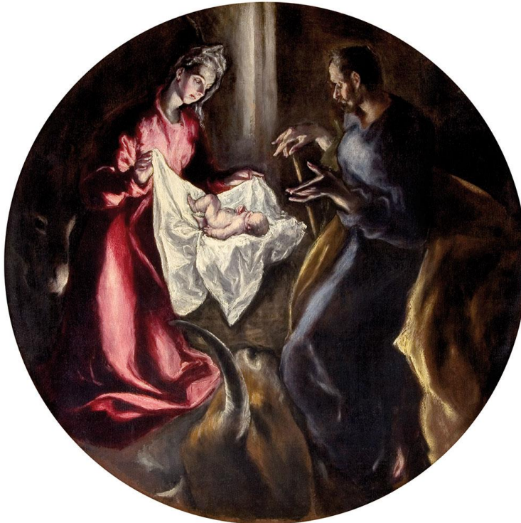
El Greco, Nativity, 1603-1605

The staff of the Catholic Schools Office is grateful to you for all you do each day in Catholic education throughout the school year.